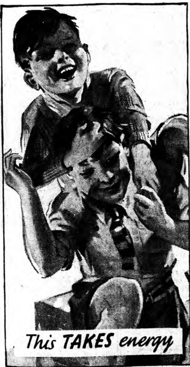
This TAKES energy

Every youngster likes it... every mouthful builds warmth