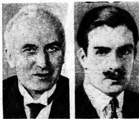
Sir J. Simon. Captain Eden.

AND IS PATTED ON SHOULDER BY SIR J. SIMON