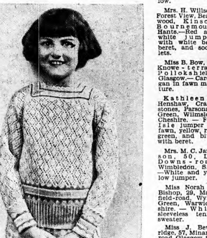
Below—A Jumper suit in pale green has been awarded the third prize, £5, in Class 2.