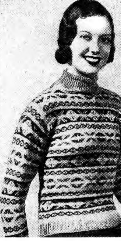
Above—In brown and white with red and yellow diamonds, this Jumper was awarded the first prize of £30 in Class 2.

BELOW is given the full list of prize-winners in the £300 Spring Knitting, Crochet, and Embroidery Competition. Many thousands of entries were received for this contest, and the standard of work was so universally high in each class that the work of selection proved extremely difficult. The judges had an arduous task in making the final awards. Entries are being returned with all possible despatch.