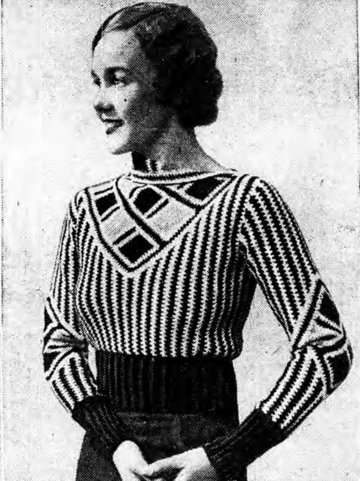
Above—In brown and white with red and yellow diamonds, this Jumper was awarded the first prize of £30 in Class 2.