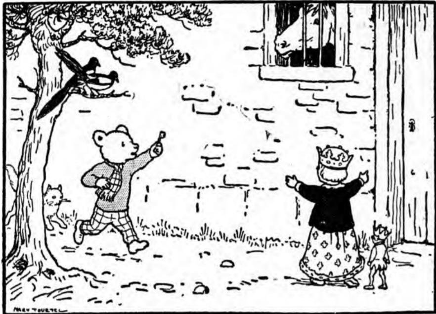
They stole out safely. "Now," said Puss, Rupert holds high the key. He calls: "Our work is well begun." Then off to where the others wait "Quick, Quick! Now to unlock the door," Fast as they can they run Cries the Princess eagerly.

Rupert & the Little Man in Green By Mary Tourtel No. 29—Rupert Brings The Key